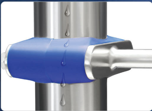
CSD SERIES RISER/VERTICAL LINE